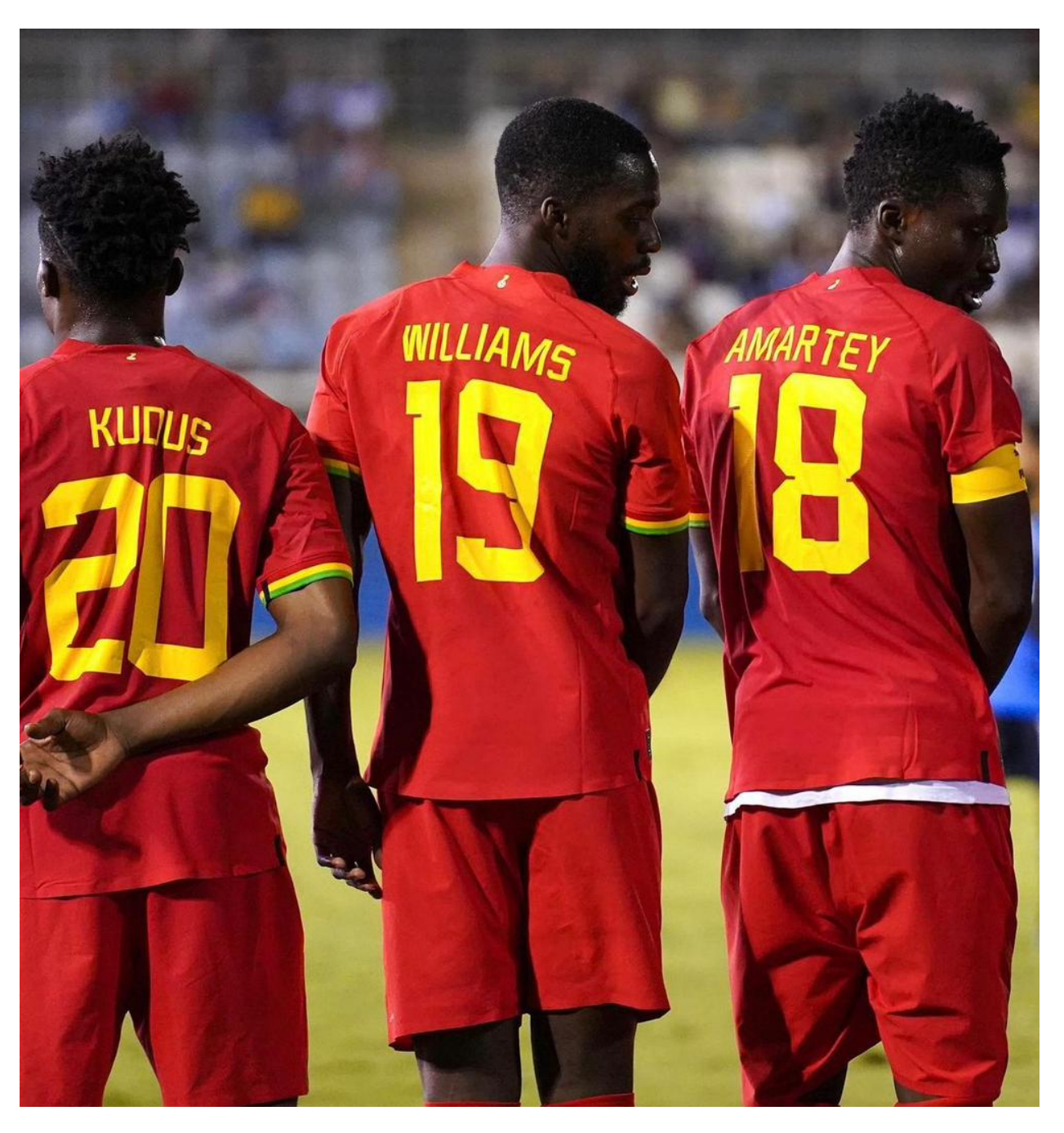
Will this rating rather be an advantage for the team by going to Qatar with a point to prove?